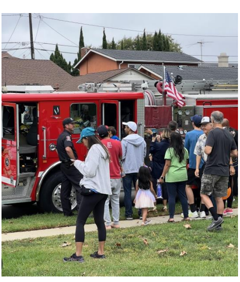
Thank you, Torrance Police & Fire Departments!